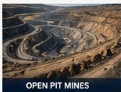
OPEN PIT MINES